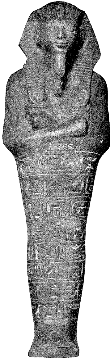
Diorite ushabti figure of Amen-hetep II. , King of Egypt, about B.C. 1450. [35,365.]

WALL-CASE 138. A group of ill-shapen but interesting ushabti figures made of alabaster, with ornaments, names, etc., in red and green paint. XVIIIth to XXth dynasties. Typical examples of shabti figures of the XVIIIth and XIXth dynasties are those of:—